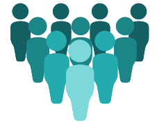
SOCIAL MEDIA MANAGEMENT